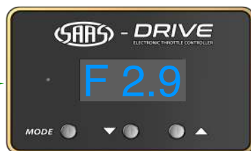
F2 Sports mode: