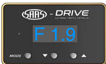
F1 Comfortable mode: