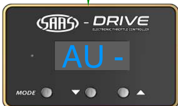
AU Auto mode: