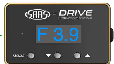
F3 Racing mode: