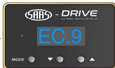
ECO Fuel saving mode: